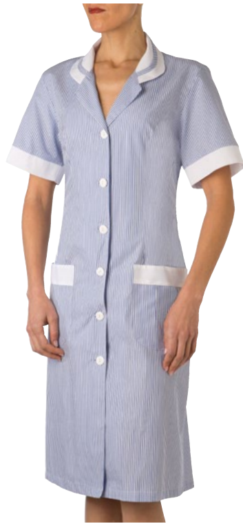
R/321 Royal striped