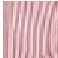
R006 Burgundy striped